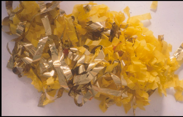
sample 9. Royal litters

In the private part, only accessible to the royal family's invitees, there were islands of yellow and golden bits of paper.