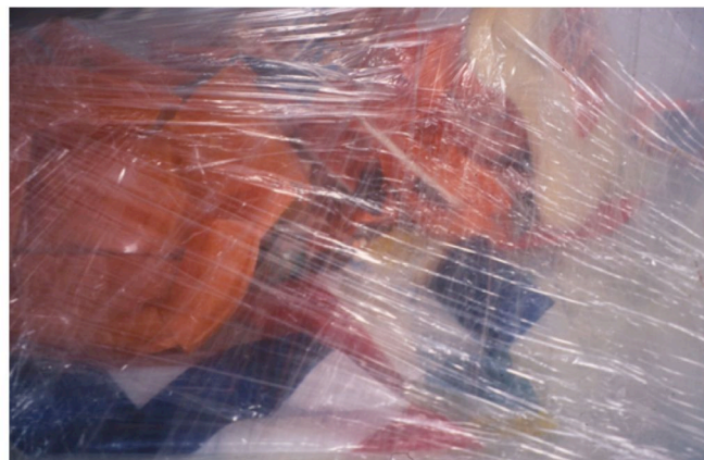
Dutch Bruto National Public Waste Product - part of sample 3

The waste in the United States is larger per item than European waste.